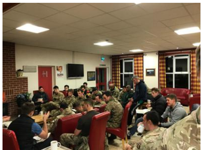
Soldiers during training in Ballykinlar

The work in Ballykinlar continues but has slowed down a little as there has not been as many requests for us to open although we continue to work regularly with the Army recruitment team when they have groups of school leavers down for a "look at life" in the army. We are still available to open on request for cadets and evenings for the regiments using the ranges for training.